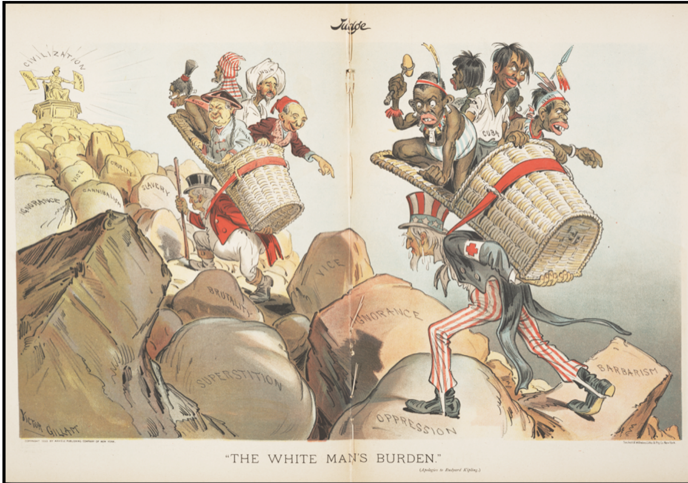
"THE WHITE MAN'S BURDEN."