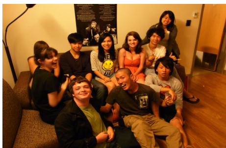
Members of the 2012-2013 Living-Learning Community