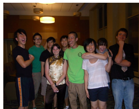
Members of the 2012-2013 Living-Learning Community

Overall, the reviving of the East-West Living & Learning Community has been well received. Students are not only learning a great deal about the cultures and languages of the countries they are studying, but are building life-long friendships while doing so.